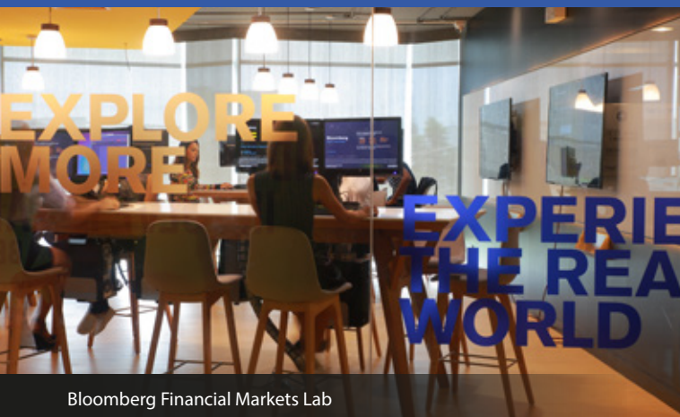
Bloomberg Financial Markets Lab