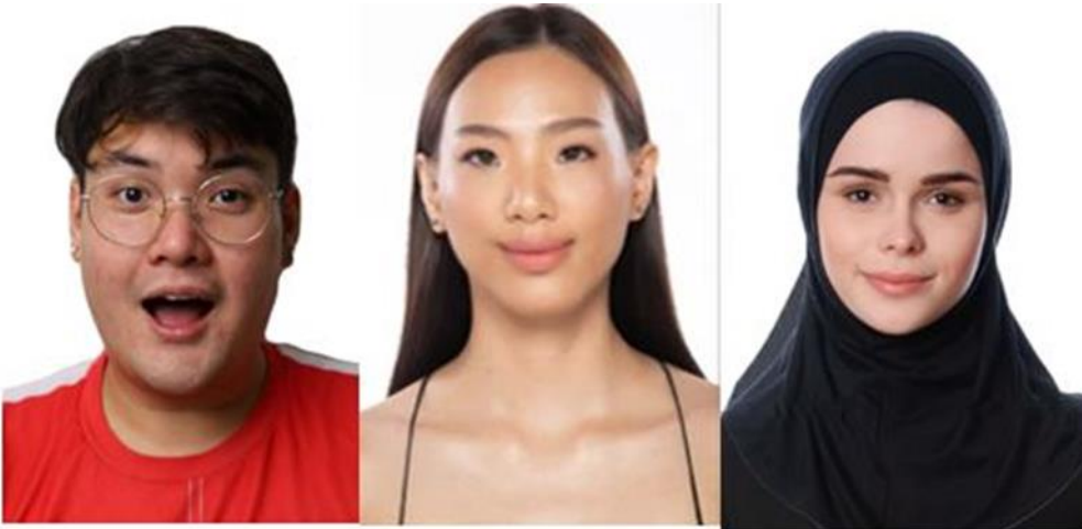
Example: Cheerful smiley face/หน้ายิ้มร่าเริง