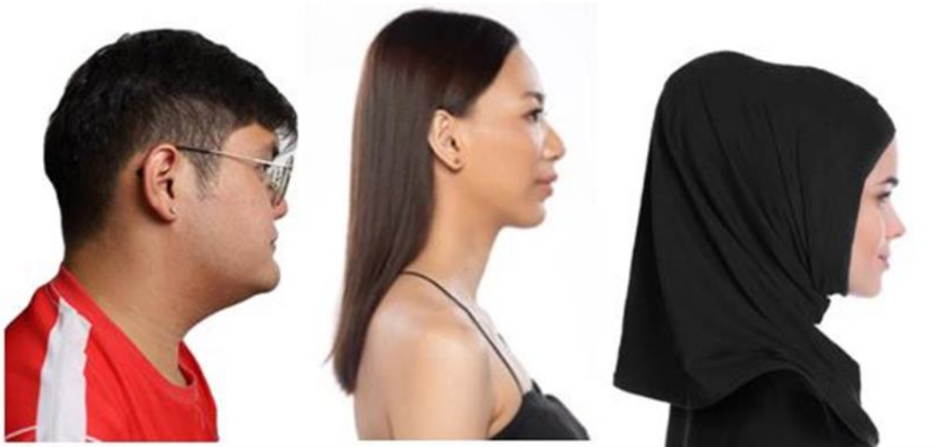
Example: Right side facing / หันข้างด้านขวา