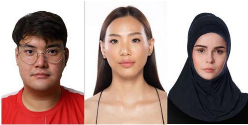
Example: Straight facing/หันหน้าตรง